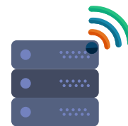
High speed Internet with LAN connection