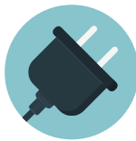
Latest hardware configuration with multi-media add-ons and good network topology.